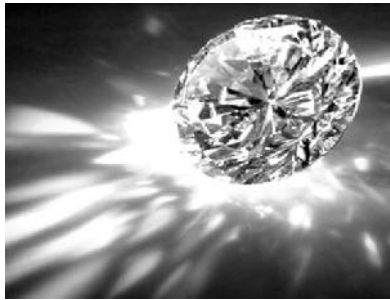
Leadership for You!