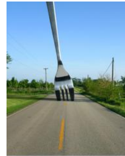
Dilemmas: A Fork in the Road?

Basis of The MINE SKILL Leadership Programme